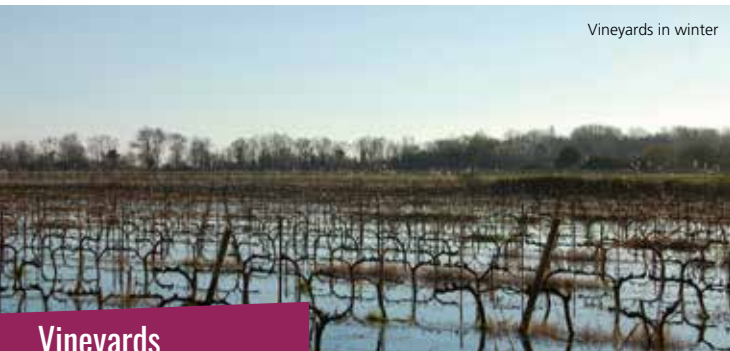
Vineyards in winter

The Santiago-de-Compostela pilgrimage route is a reminder of the apostle James (alive at the time of Christ) who is supposed to have been beheaded around 41-44 AD. His tomb was discovered during the reign of Charlemagne and Alphonse II the Chaste (759-842). This route attracts numerous pilgrims. The "Via Tolosana" that starts in Arles is one of four routes through France to James' tomb.