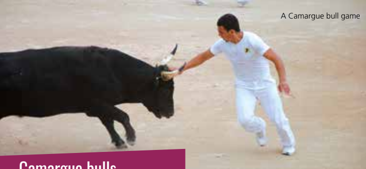
A Camargue bull game