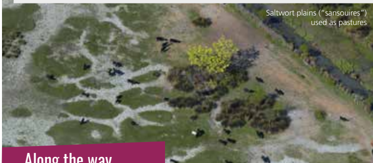
Saltwort plains ("salsouires") used as pastures

Caution! Consult the weather forecast before starting : the Camargue is regularly exposed to the mistral wind