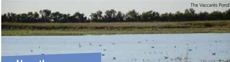
The Vaccarès Pond

Caution! Consult the weather forecast before starting : the Camargue is regularly exposed to the mistral wind