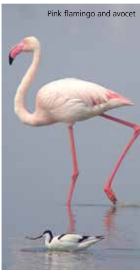
Pink flamingo and avocet

The Camargue National Preserve was created in 1927 by the French National Society for Nature Protection, in order to protect plant and animal species. The Preserve covers 13,117 ha, of which a large part is occupied by the Vaccarès Pond. La Capelière is a tourist information center managed by the National Preserve. You will find there discovery trails, exhibitions, documents.